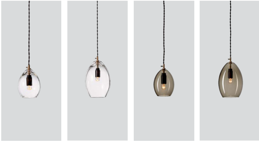
Unika small – Item no. 530