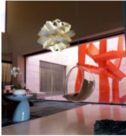
Catalogue Pg. 10-21, 244-245, 252